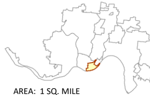
AREA: 1 SQ. MILE