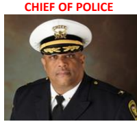
CHIEF OF POLICE