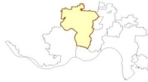
AREA: 18 SQ. MILES