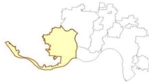
AREA: 20 SQ. MILES