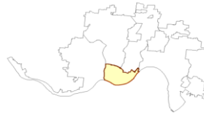
AREA: 4.5 SQ. MILES