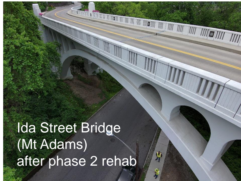
Ida Street Bridge (Mt Adams) after phase 2 rehab