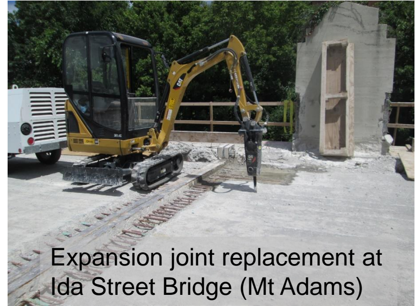
Expansion joint replacement at Ida Street Bridge (Mt Adams)